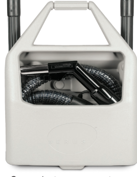
Convenient accessory storage case is also included.